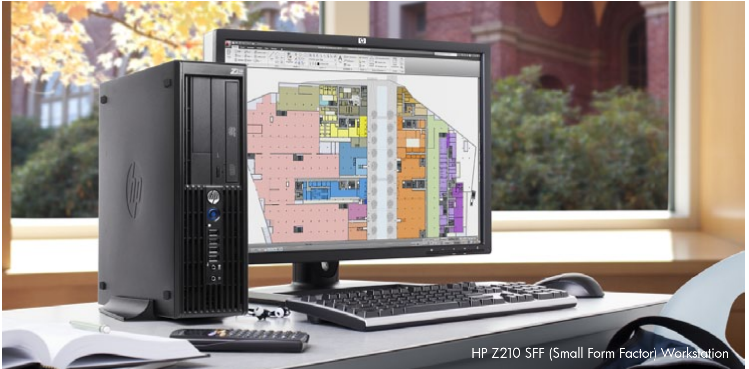
HP Z210 SFF (Small Form Factor) Workstation